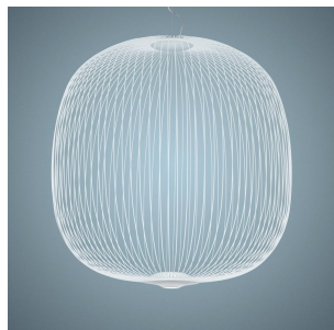
Spokes 2 Large